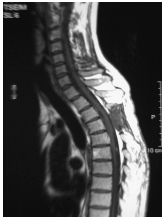
Fig. 2. Sagittal MR imaging of a patient taken 4 years after MSCs implantation.

A mean of 57 \times 10^6 cells (range: 7.0 \times 10^6 – 152 \times 10^6 ) was implanted. There were no anesthetic complications. No patients manifested severe adverse events defined as respiratory failure, death and neurological symptoms which persisted