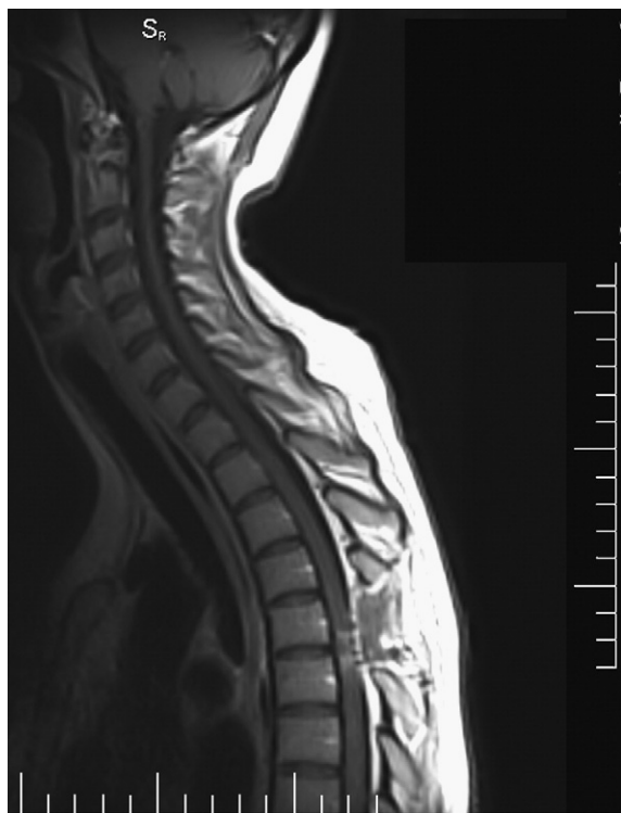
Fig. 1. Sagittal MR imaging of a patient taken one week after MSCs implantation.